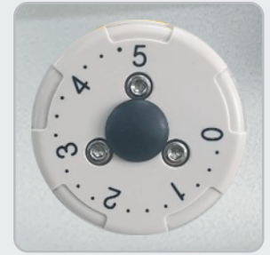
Stitch adjusting dial lock 땀수 다이알 락고정 적용