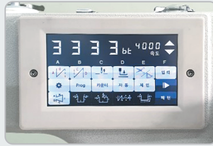
4.3 inch touch Operation Panel 4.3인치 터치 패널